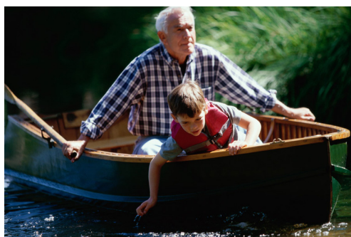
Stretch frequently to work out the physical stresses of your vacation activities.